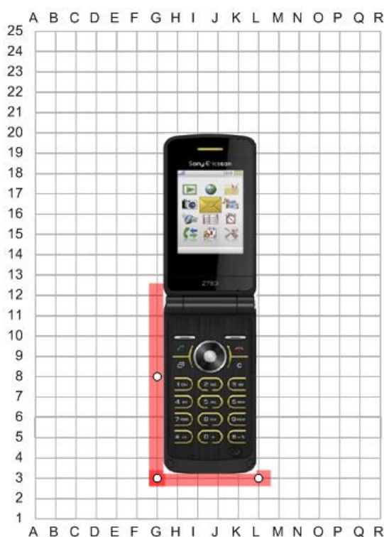
Rohde & Schwarz Coupler with a Grid Positioning plate Reference point G3